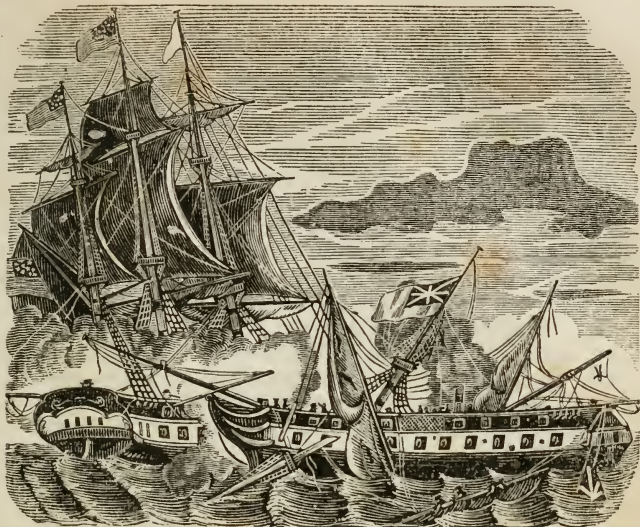
BATTLE OF THE CONSTITUTION AND GUERRIERE.....COMMODORE HULL.